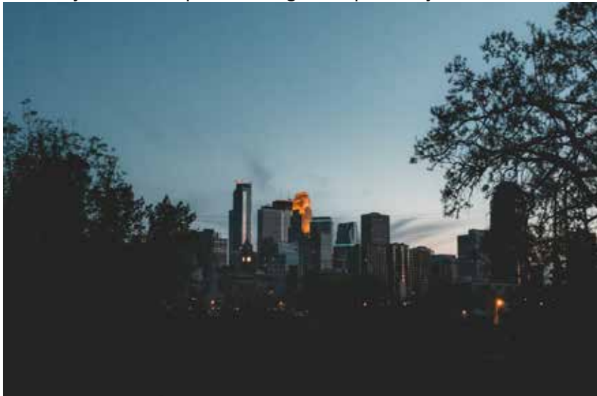
Minneapolis has suffered the killings of two of its residents at the hands of federal immigration agents.