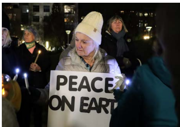
Clergy members and community participants walked from Elizabeth Caruthers Park to the Portland ICE facility as part of the vigil.

More than 75 faith leaders and congregation members gathered to participate in the service, meeting at Elizabeth Caruthers Park before walking to the ICE facility together. In the alleyway between the ICE facility and storage center next door, organizers held a short service consisting of prayers, carols and scripture readings.