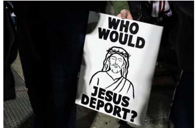
Messages of support for detained immigrants are displayed on signs carried by vigil attendees.