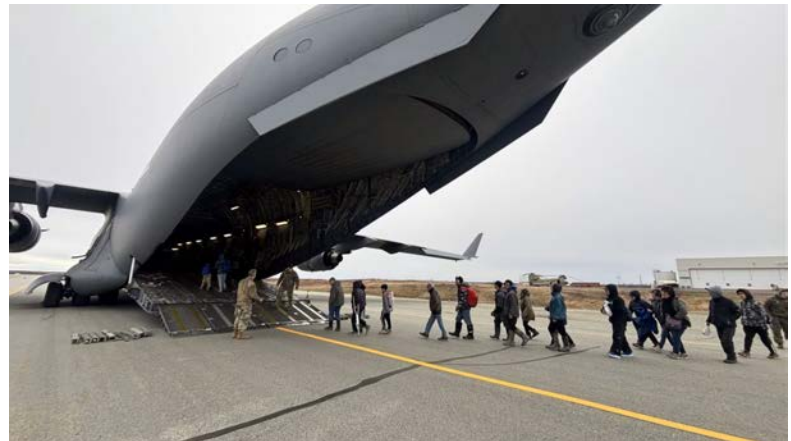
Alaska Air National Guard C-17 Globemaster III aircrew evacuates about 300 displaced western Alaska residents, following a severe storm that hit Alaska’s West Coast.