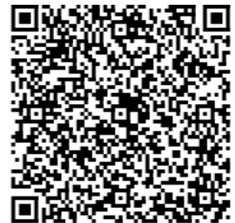
Scan with your phone to give online