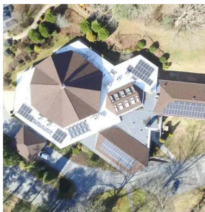
Trinity Presbyterian Church in Hendersonville, North Carolina, installed 129 solar panels in 2019, reducing its electricity consumption by 90% compared to the previous year. It's since become an Earth Care Congregation, promoting sustainability and environmental awareness.

Many of us in the Presbyterian Church (U.S.A.) — which has had decades of policy and theology that affirm our calling and responsibility to care for God's Creation — are reeling from the new administration's attack on environmental and climate change commitments.