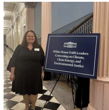
The PC(USA) is a leader in many areas, including having a presence at UN gatherings, having an Office of Public Witness on Capital Hill and speaking truth to power during congressional hearings. Faith leaders are important because we emphasize climate justice as a moral issue. (Photo from the White House Council on Environmental Quality (CEQ) Faith Leaders Convening on Climate, Clean Energy and Environmental Justice , attended by Presbyterian Hunger Program staff.)

Since the 1950s, the General Assemblies of the PC(USA) and its predecessor denominations have spoken to our responsibility to care for God's Creation and to be mindful of our use of natural resources. Since then, the PC(USA) has demonstrated our care for God's Creation and our responsibility to the Earth and all its people through numerous policy statements . The 202nd General Assembly (1990) through the " Restoring Creation for Ecology and Justice " policy affirmed ecology and justice work as imperative to our faith.