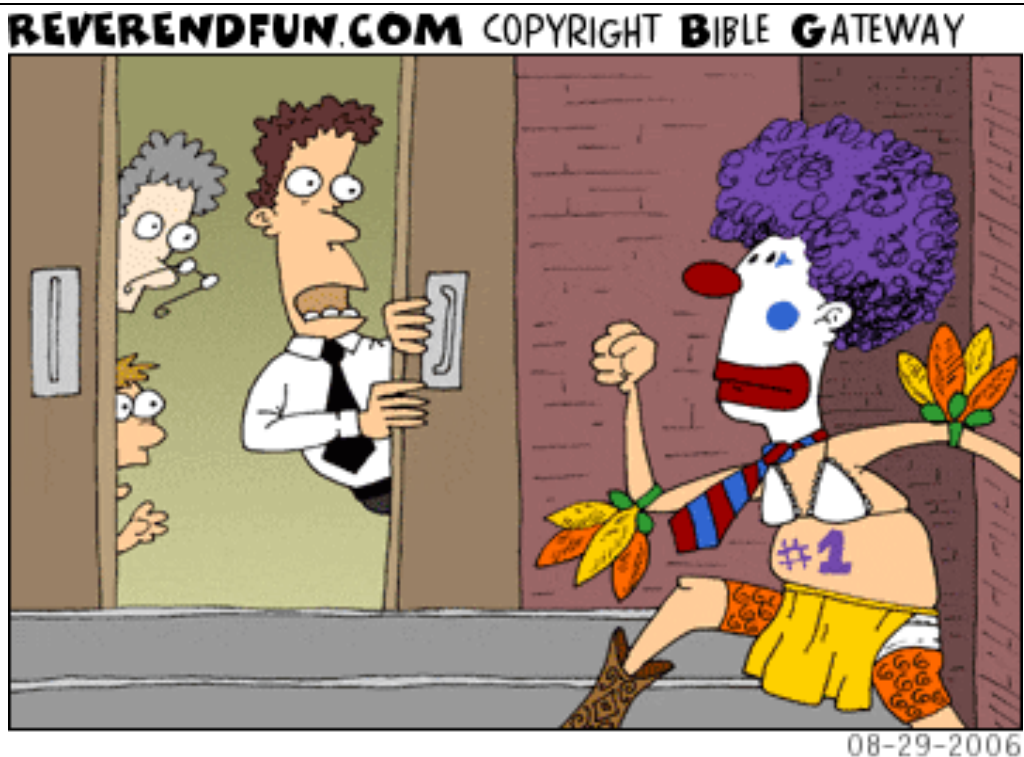
THE CHURCH WAS NOT PREPARED FOR THE SURPRISE TOLERANCE DRILL

If you have anything that you would like included, please send it to the church office by 12 noon on Wednesday on the 1 st or 3 rd week of the month.