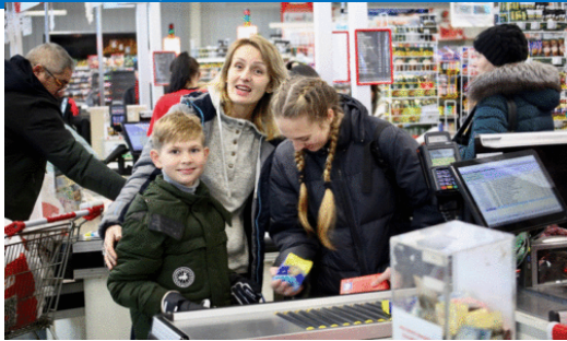
The ministry of This Child Here began by, among other services, meeting families in grocery stores and contributing to their needs.